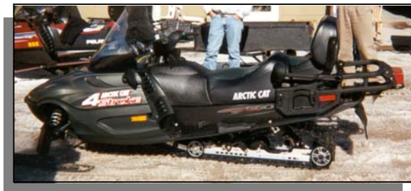
Arctic Cat 4-cycle engine snowmobile demonstration at ASC

The overall reaction after the demonstration was that the snowmobile was quiet, had low odor, and was comfortable, but that it did not have enough power for the ski area needs and was too heavy to maneuver in the shop. Responses of individuals that tested the snowmobile are summarized in the following table: