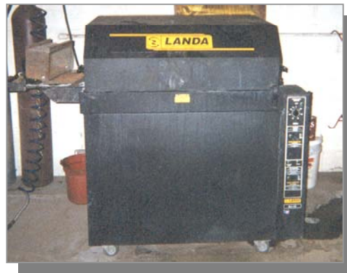
Spray cabinet in Buttermilk Mountain vehicle maintenance shop

After the switch to aqueous cleaning, operation and maintenance costs associated with part cleaning range from $15,600 to $19,800 per shop. Implementation details and a cost analysis for the Buttermilk Mountain vehicle maintenance shop are summarized below.