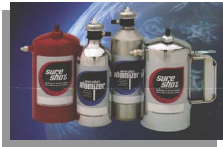
Refillable spray bottles

Construction Material. Refillable spray bottles are available in different materials (aluminum, stainless steel, brass, and steel) and with different finishes for use with different types of bulk product. Steel is the most common construction material for spray bottles used in vehicle maintenance shops. Ask the spray bottle manufacturer for a bottle compatible with the product to be used in it.