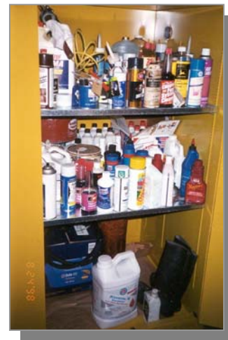
Clean up messy lockers by decreasing aerosol can use

Each year, ski area vehicle maintenance shops generate hundreds of used aerosol cans of brake cleaner, carburetor cleaner, lubricant, and other products. An alternative to aerosol cans is a refillable spray bottle. There are two basic types of refillable spray bottles: (1) metal bottles that spray product using compressed air and (2) plastic bottles that use a hand pump to spray product. Refillable metal bottles more closely resemble aerosol cans in terms of their design and performance. These bottles are filled with products such as brake cleaner from bulk containers and expel products at pressures ranging from 80 to 200 pounds per square inch (psi) of shop-compressed air (80 psi is the minimum pressure needed to expel product, and 200 psi is the upper pressure limit of the bottles). Plastic bottles are also filled from bulk containers but do not require compressed air; rather, they are operated by pumping a trigger to create a mist or stream of product. Compared to refillable spray bottles, aerosol cans are more expensive and have greater environmental impacts: