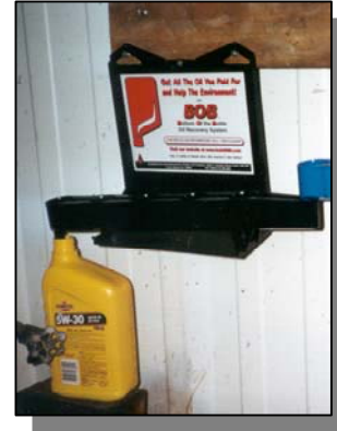
BOB at A-Basin vehicle maintenance shop

Although it’s preferable to use bulk oil delivery systems to decrease solid waste (empty oil bottles), save time, and reduce spills, some ski area vehicle maintenance shops maintain a stock of 1-quart oil bottles. “Empty” quart oil bottles contain oil residue, which not only represents wasted oil, but can prevent recycling of the bottles. In the U.S., 3.34 billion quart bottles of oil are produced every year. Each of those 32-ounce bottles contains about 4 percent (1.25 ounces or 2.5 tablespoons) of oil when disposed of. That is equivalent to 3.5 Exxon Valdez spills per year. 1 Plastic Oil Products manufactures the Bottom of the Bottle Oil Recovery System, or BOB. BOB is a small, plastic device designed to conveniently drain and recover oil residue from oil bottles. After draining overnight on BOB, plastic oil bottles (which are usually #2 plastic) are recyclable, and the drained oil may be used or recycled. One BOB device costs $9.99.